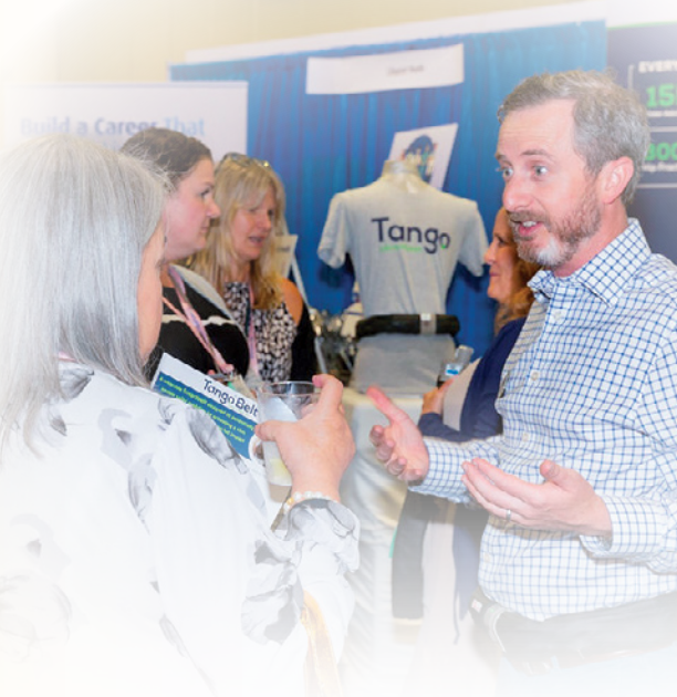
Exhibit your cutting-edge discoveries at ARN's 2024 Rehabilitation Nursing Conference, presented both in-person and virtually. Showcase your products that enhance the care for our nurses' patients and promote thought leadership within your field. Meet the leaders, decision makers, and frontline healthcare professionals in rehabilitation.

Our mission is to promote and advance professional rehabilitation nursing practice through education, advocacy, collaboration, and research to enhance the quality of life of those affected by disability and chronic illness.